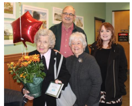
Celebrating 100 Rides with Volunteers and Staff